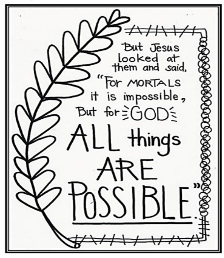
Church of Saint Leo the Great