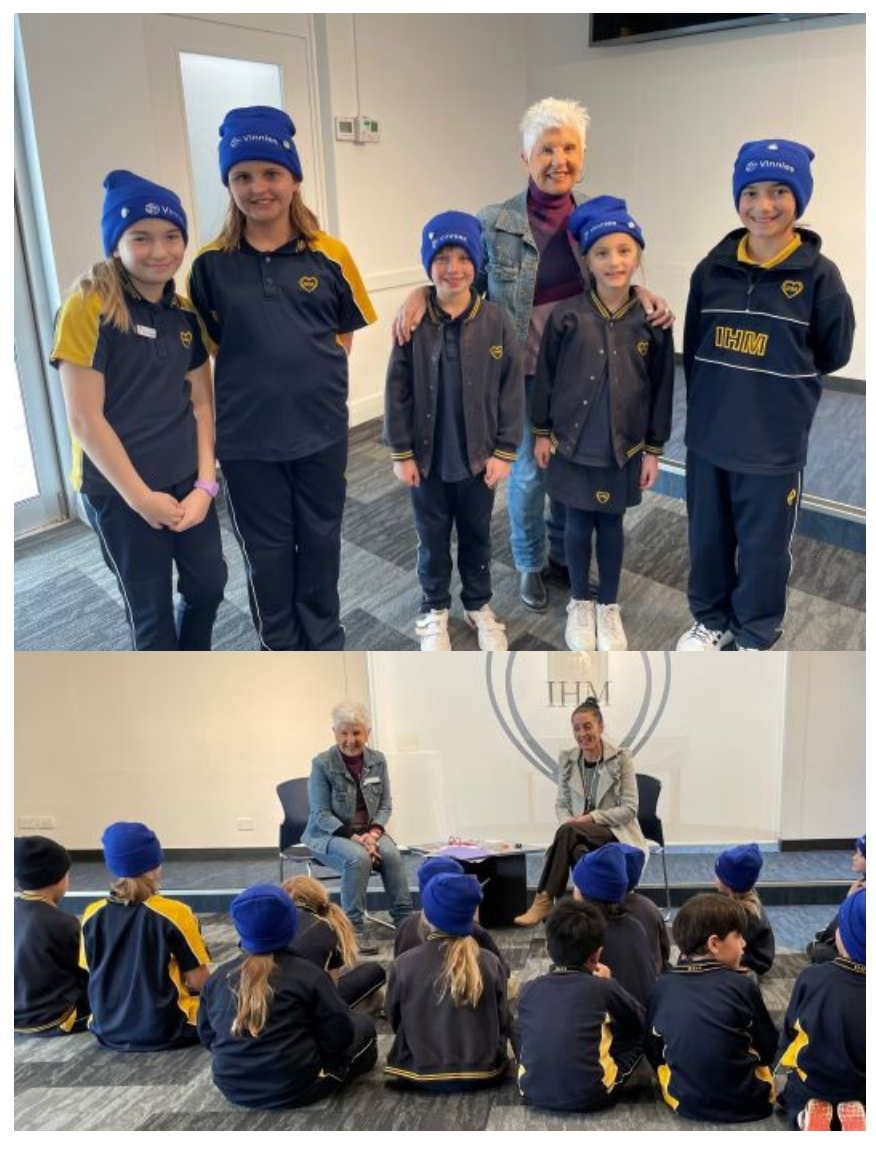
Term 3 Liturgical and Mass Celebrations

The SRCs kindly ask that on Friday 5<sup>th</sup> July we wear our favourite Sport Guernsey/Top and bring along a Gold Coin Donation . All proceeds will be going to the St Vincent de Paul Winter Appeal. No sports equipment is allowed to be brought to school on Friday.