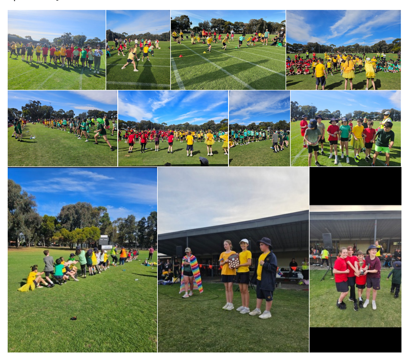
Pupil Free Day - Friday 15th November