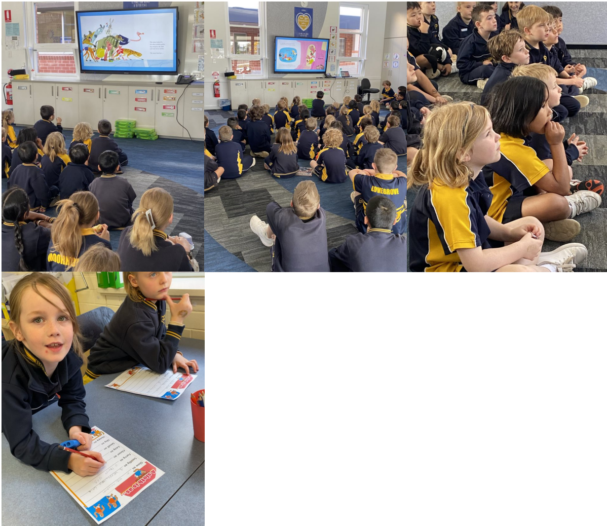
View this article online to read more