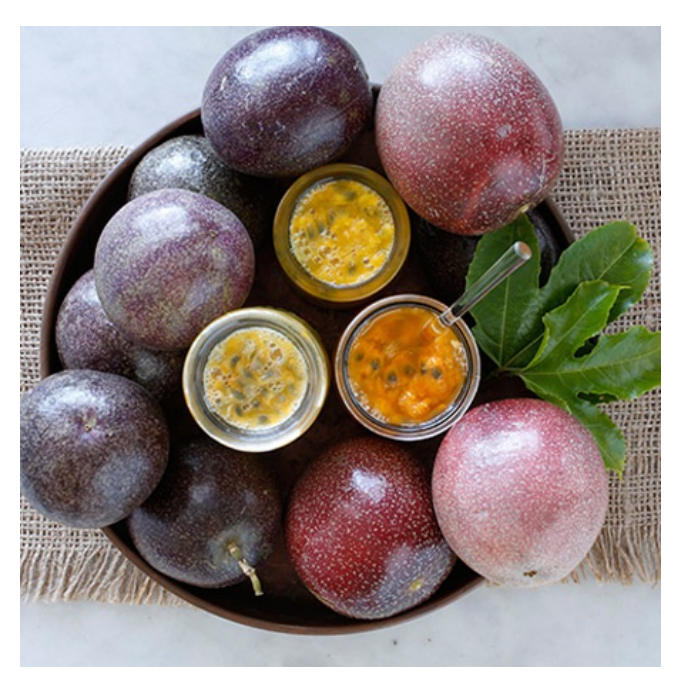
JACOB - The capacity of Adelaide Oval is 53,500. It was built in 1871.