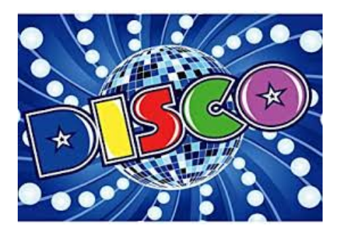
View this article online to read more